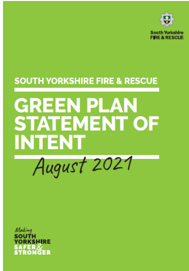
Agreed Green Plan Statement of Intent